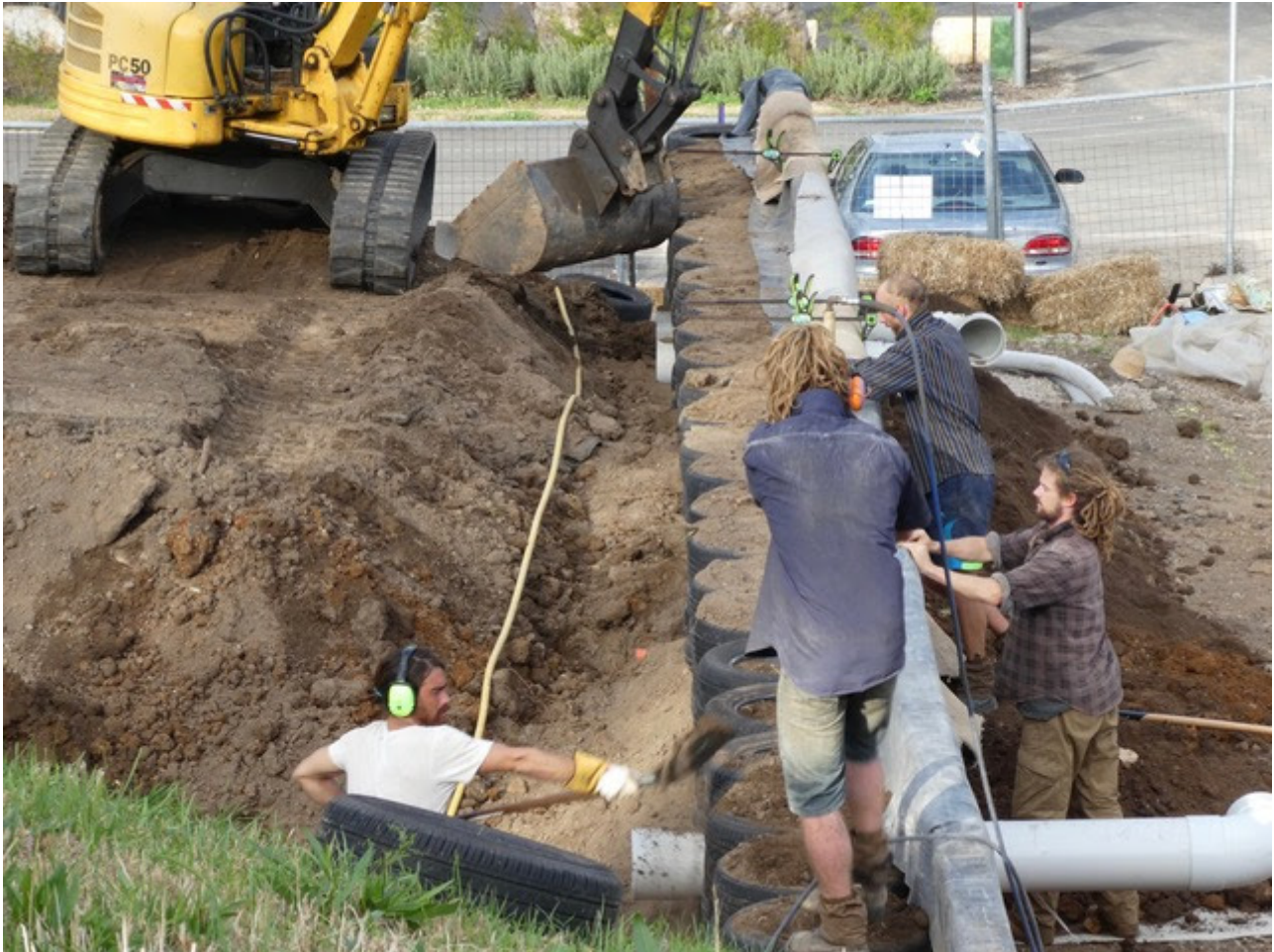
Photo below: On Saturday you will also be able to see the construction of NSW's second Earthship construction in progress (photo last week). The home will include a huge range of natural and recycled materials, including rammed earth and strawbale construction. Based on an American concept, the design has been adapted to local conditions. Come along and find out what the big pipes are for, and what the tyres do!